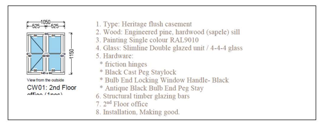
Figure 4: Description of works quoted by Woodcraft Windows: Second floor window

It is intended to replace the windows like for like with wooden windows with slimline double glazing as per the description provided by Woodcraft Windows.