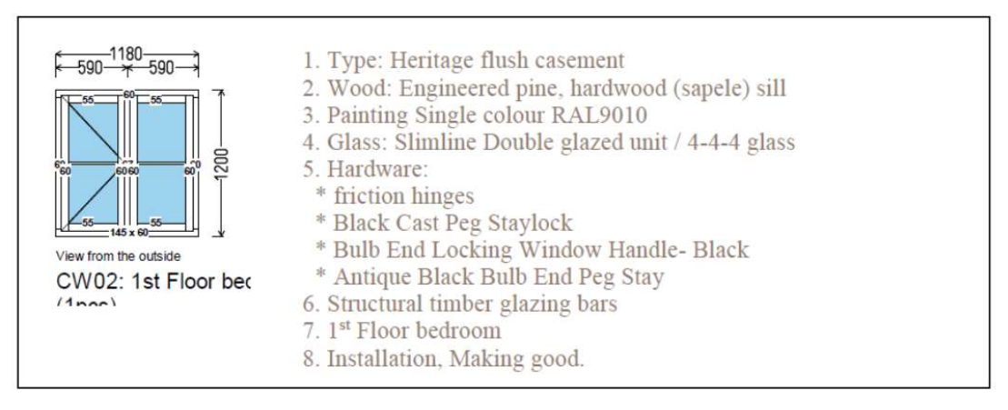
Figure 5: Description of works quoted by Woodcraft Windows: First floor window

These windows have been chosen to be in keeping with the existing windows. The continued use of slimline double glazing will ensure the windows provide a level of insulation in a style appropriate to the heritage of the property.